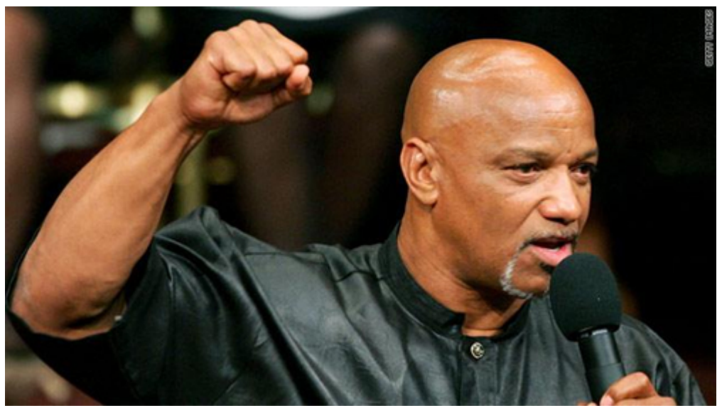
ositive Reflection of Self is very important. Never underestimate its value

I was born in Wisconsin and the only thing we saw HBCU related was "Drum Line." It was not until a local organization sponsored a Black college tour that reached out to youth to make us aware of these institutions. I chose Alabama State University, (where we like to call it myASU), because of its rich tradition in producing educators, affordable tuition as I received a full-ride from there and not at the PWIs (predominantly White Institution) I applied to, and I had known a few people attending there as well.