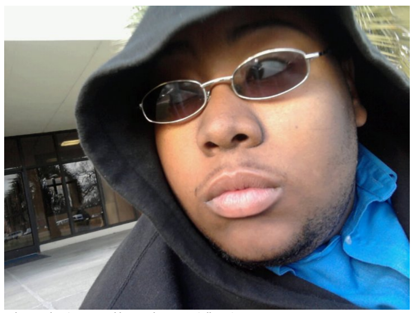
Wilson-Booker Science Building on the Morris College Campus