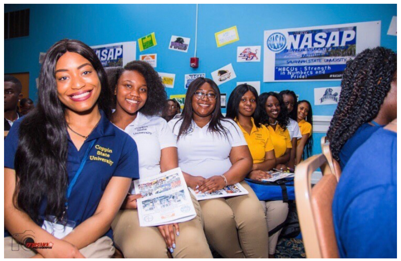
Coppin State University's SGA and SAPB at NASAP SLI 2019