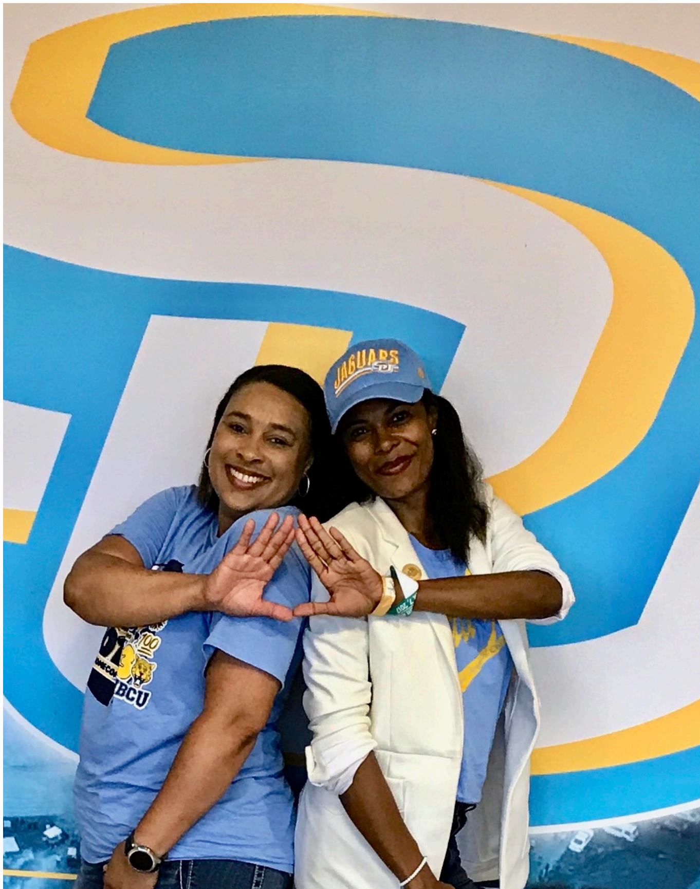
Delta Sigma Theta Sorority, Inc. Alpha Tau line sisters